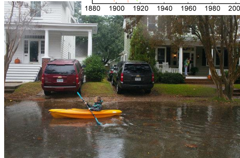
Manchester Avenue, Norfolk, 29 October 2012. Hurricane Sandy missed Norfolk, but still caused serious flooding.